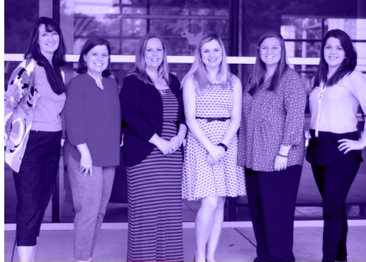
Community Engagement Team