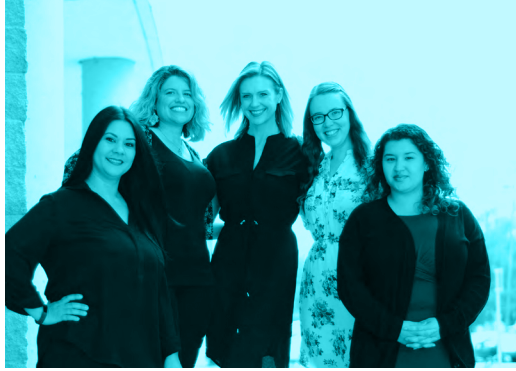
Multi-Disciplinary Enhancement Team