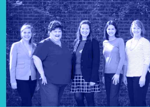
Administration and Operations Team