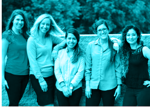
Forensic Interview Team