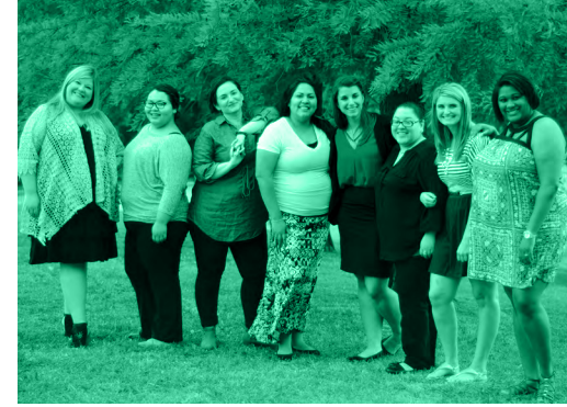
Family Advocate Team

3,400 children referred for services by members of our Multi-Disciplinary Enhancement Team.