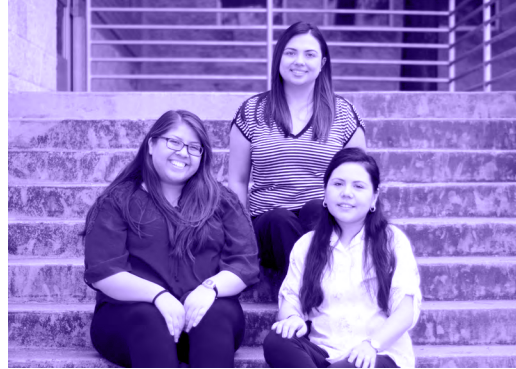
Client Relations Team